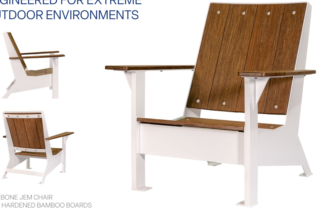
WISHBONE JEM CHAIR WITH HARDENED BAMBOO BOARDS

ENGINEERED FOR EXTREME OUTDOOR ENVIRONMENTS