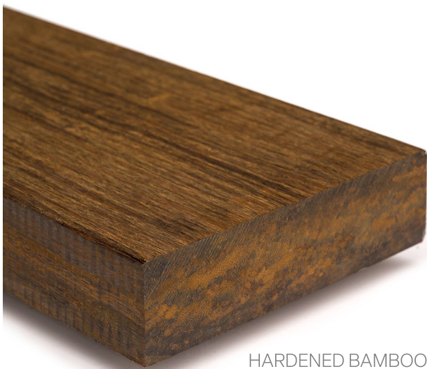
HARDENED BAMBOO WITHOUT OIL OR STAIN